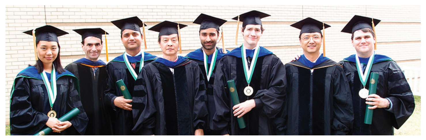
From the Spring 2013 until Spring 2014, the department awarded 10 Master's and 7 PhDs. The following is the list of graduate students who successfully defended their theses or dissertations.