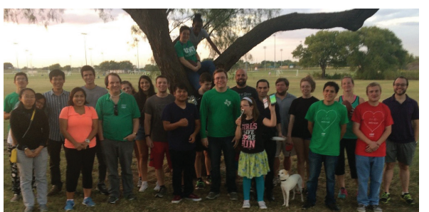
Math Club Picnic, Fall 2016

The Math Club, consisting mostly of undergraduate math majors, meets every Friday at 1 p.m. in GAB 440A to discuss mathematics informally, interact, and play games. The math club organizes a picnic each semester at North Lakes Park. Soccer, croquet, and ultimate frisbee are among the favorite activities at this fun social event. On March 30, members of the math club attended the Mathematical Association of America (MAA) Calculus Bowl at Texas A&M University-Commerce in Commerce, Texas. Our team came in 6th out of 28 teams. For more information about the math club, go to <u>http://math.unt.edu/seminars/math-club</u>.